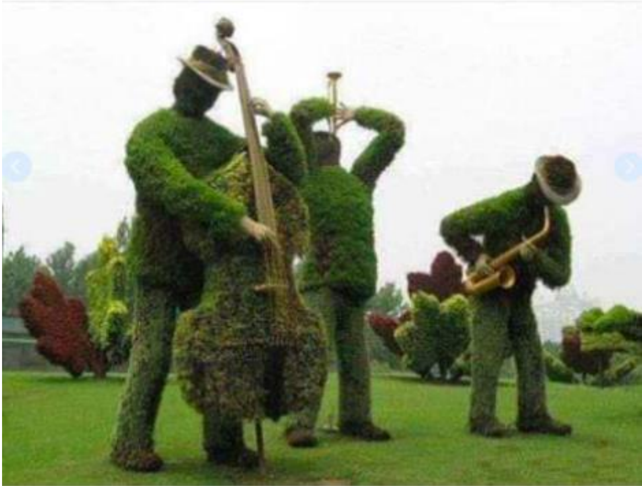
June 2, 2023 Facebook Post by National Garden Council, Inc.

Although their music was cutting hedge and highly sod after, this was unfortunately just a topiary gig.